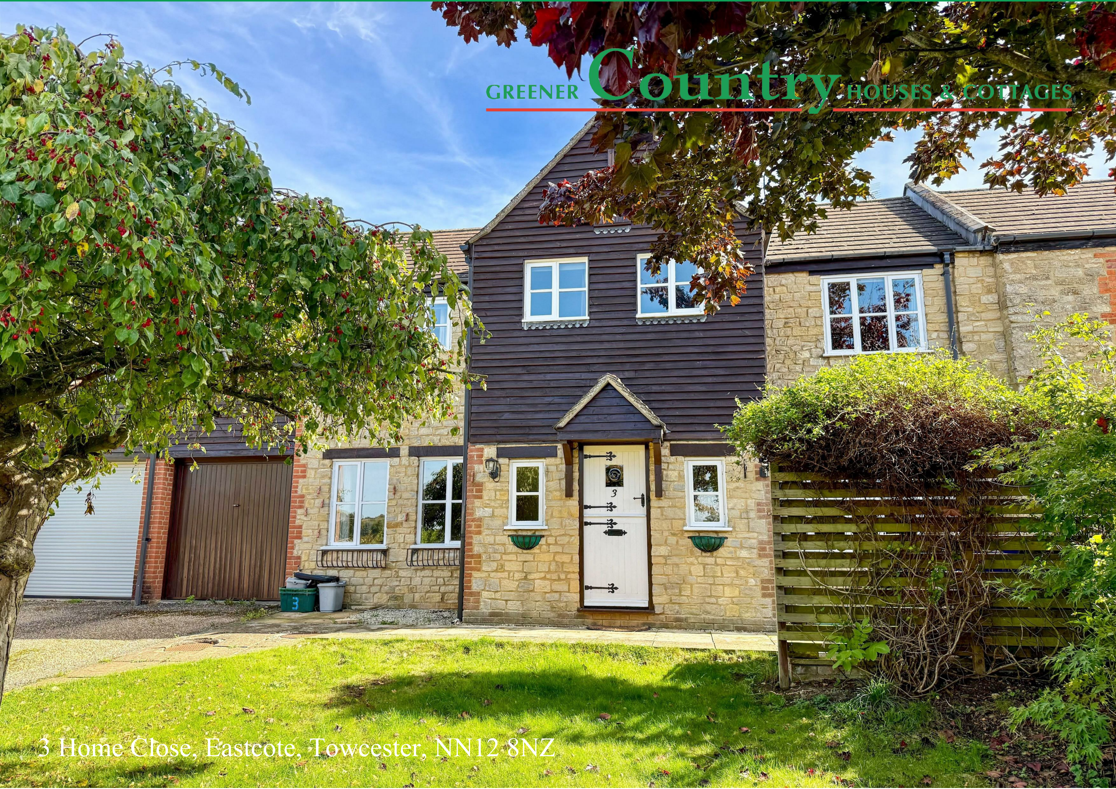
3 Home Close, Eastcote, Towcester, NN12 8NZ